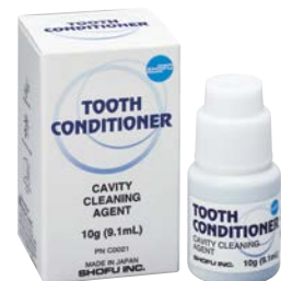
Tooth Conditioner 10gm ( 9.1 ml ) [PN C0021]