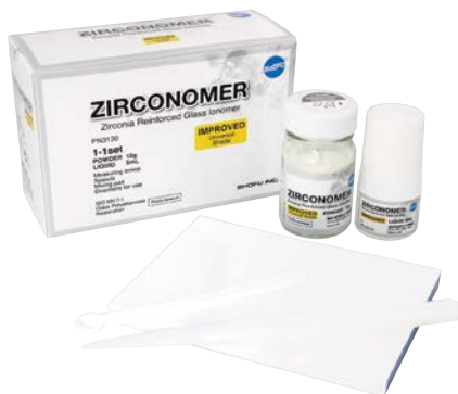
ZIRCONOMER IMPROVED 1-1 Set (12gm / 5ml) [PN 3130]