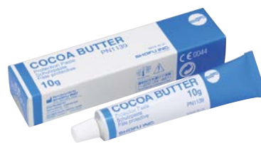
Cocoa Butter 10gm [PN 1139]